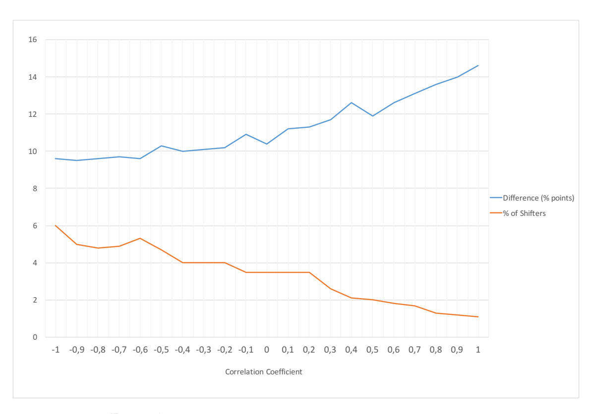
Figure 1: Features of the Optimal Allocation (Benchmark Case)